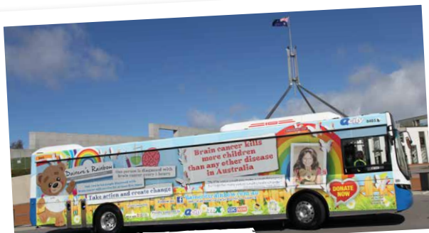
Qcity Transit Full Bus Wrap elevating awareness